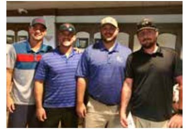
Flight 1 Winners - BA Supply (54)