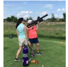
Golfers enjoyed trying their luck with the ball launcher.