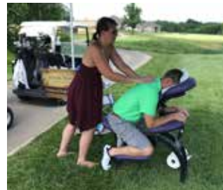
Massages for golfers provided throughout the day.