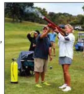
Ball Launcher Shoot Out!

See You Thursday, May 23 at Hillcrest Golf Club