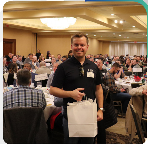
ABB Bernie Electric Wholesale Inc Board Of Public Utilities C&O Sales Capital Electric Construction Co., Inc. CBM, Inc. City Electric Supply City of Independence Clifford Power Systems Convergence Crescent Electric/BA SUPPLY Evergy Foley Power Solutions Meglio & Associates Mercer Zimmerman Midwest Equipment Company Power Equipment Sales Company, Inc. Premier Lighting and Controls, Inc. Rains Electrical Sales Inc RB Sales Corp Schneider Electric Shaw Supply Company WESCO