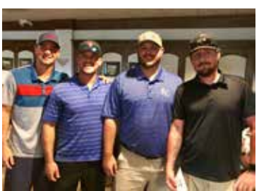
Flight 1 Winners - BA Supply (54)