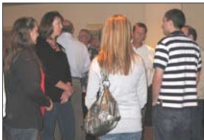
Networking is key to association members.