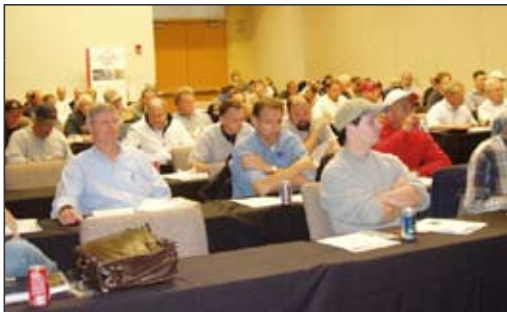
It was a full house with 80 Electrical Contractors attending the S.T.O.R.M. session.